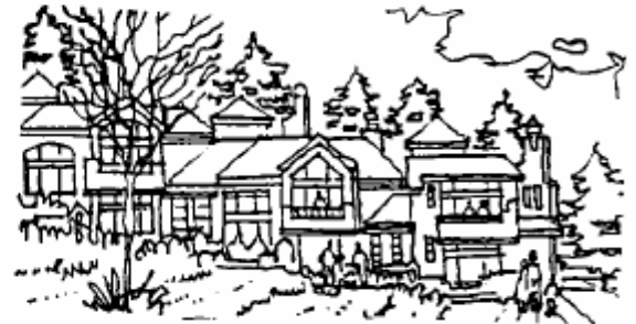
FIGURE 5- CLUSTERED HOUSING ENHANCES NEIGHBORLY INTERACTION