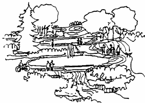
FIGURE 3 - WATER IMPOUNDMENT AREAS ENHANCE HUMAN & NATURAL HABITAT (BIODIVERSITY)

Adequate water impoundment areas reduce downstream flooding, and increase water quality and bio-diversity. This can enhance the unique qualities of each site and provide for recreation and education and thus it helps to achieve environmental sustainability.