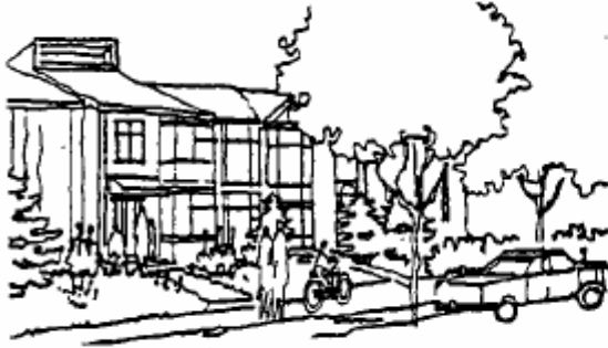
FIGURE.4 - FRIENDLY & SAFER HOUSING WITH PERSONALIZED PUBLIC & PRIVATE AREAS

Well developed residential clusters have the opportunity to share social amenities and open spaces. Orienting dwelling units to the South can enhance comfort and save energy.