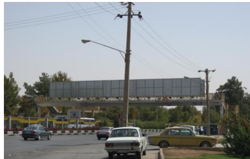
FIGURE 3 - TWO SAMPLE BRIDGES: HAFT-TAN BLVD. AND MOALEM SQ. (SHIRAZ).

The average width of the bridges was 1.4 meters, and the average length of the bridges was 34.9 meters, which is 4 meters larger than the average width of the streets under them. Also, most of the bridges were located on major two way streets