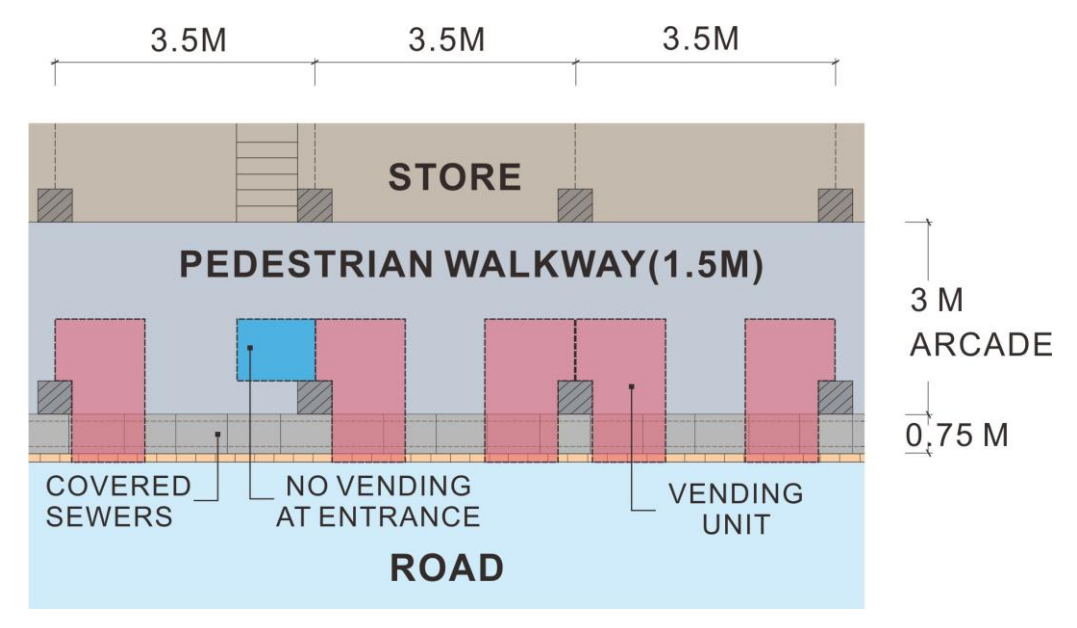
FIGURE 2 - LAYOUTS OF ARCADED VENDING UNITS

to assisting extralegal vendors to properly relocate, create a nice, clean environment for the local residents, shaping a refined image for tourists. 4