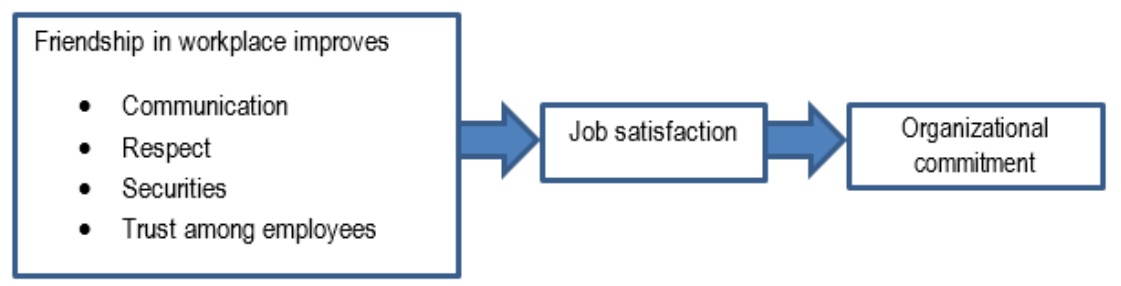
FIGURE 4 - WORKPLACE RELATIONSHIP AND ORGANIZATIONAL COMMITMENT (http://scholarworks.umass.edu)