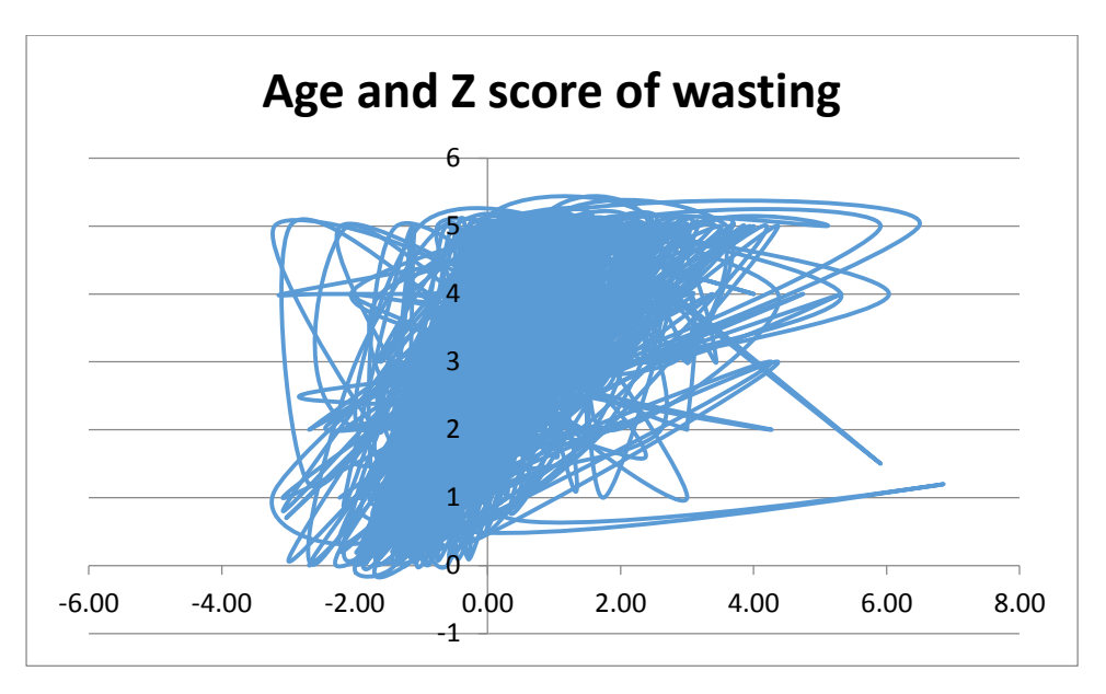
FIGURE 3 - THE Z SCORE AND WASTING:

Above figure shows that numbers of children are stunted as compare to their age. Most of the children are falling in below two to four standard deviations. The stunting among children occurs because they fall sick again and again and they are not taken to health care facility and doctor. We have also tried to find the relationship between z score of wasting and age of children. It is presented as follows.