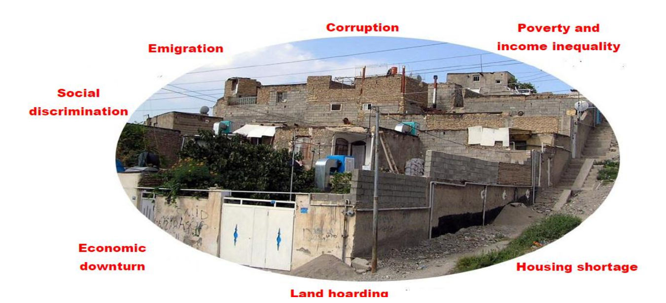
FIGURE 2 - MECHANISMS AND CAUSES THE FORMATION OF INFORMAL SETTLEMENTS