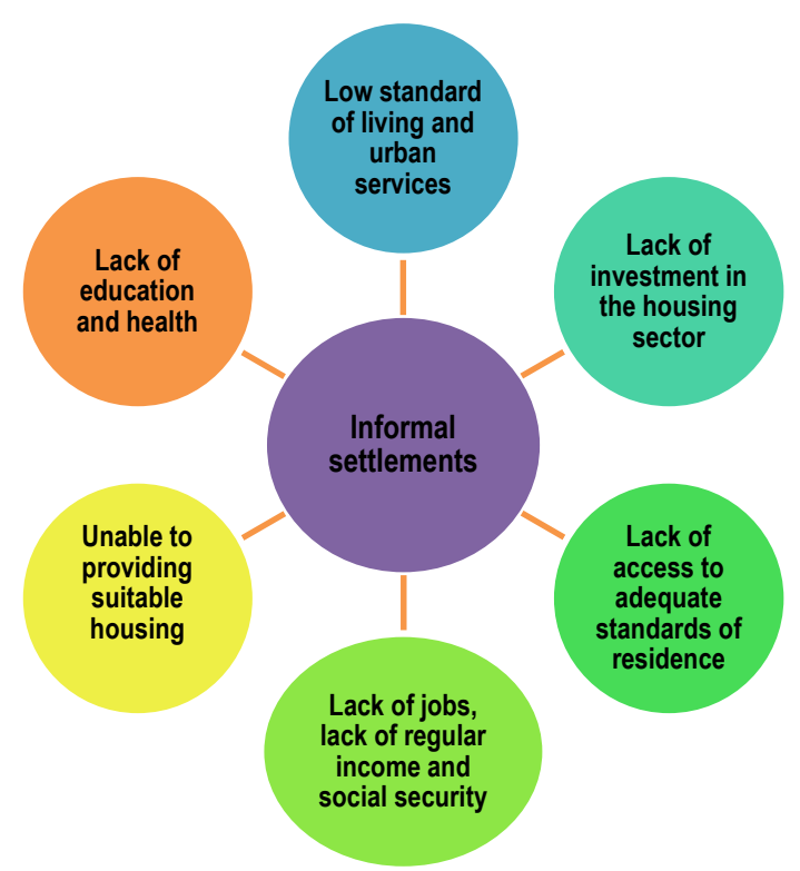
FIGURE 1 - INDICATORS OF THE INFORMAL SETTLEMENT AT THE WORLD BANK